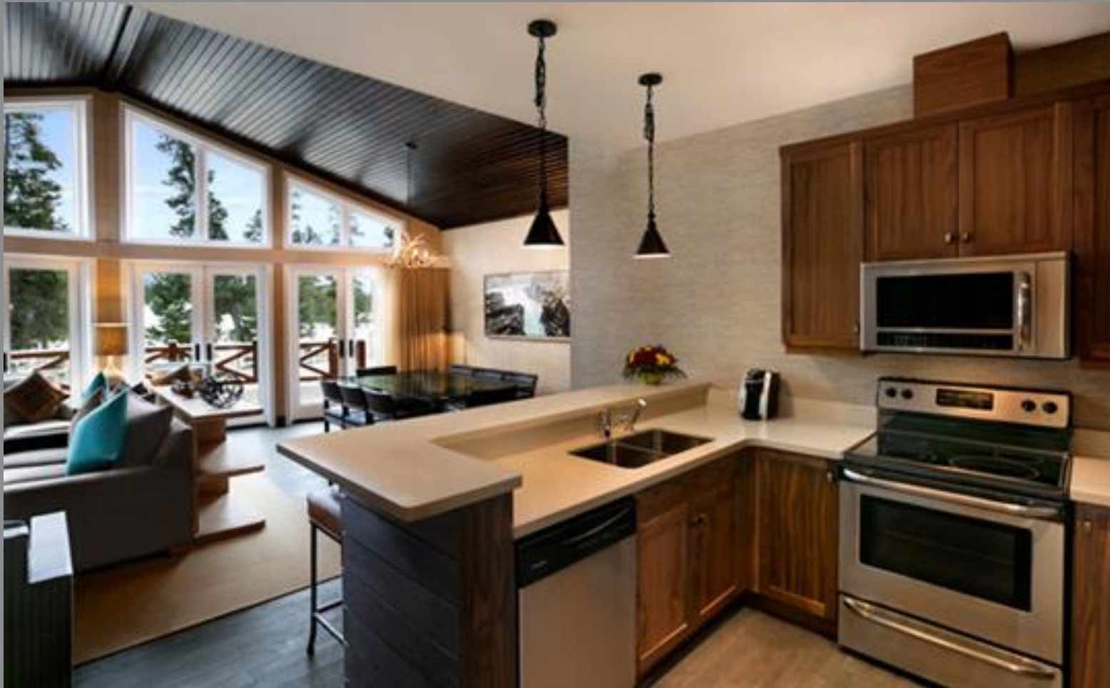
Stanley Thompson Cabin