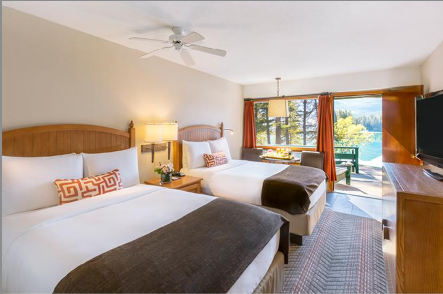
Fairmont Lakeview Room