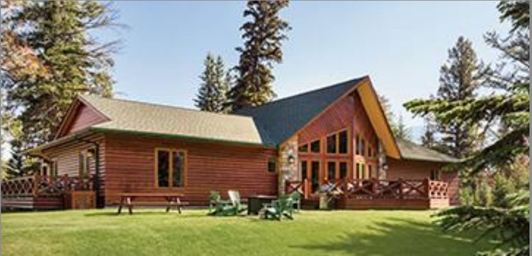
Stanley Thompson Cabin