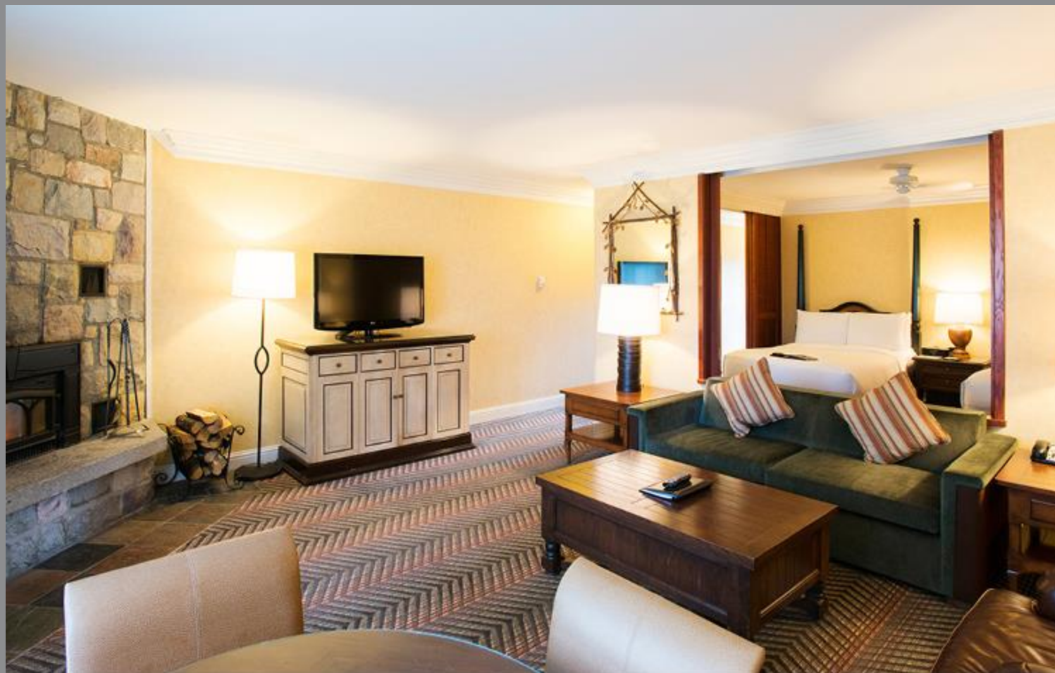
Lakefront Suite with Fireplace