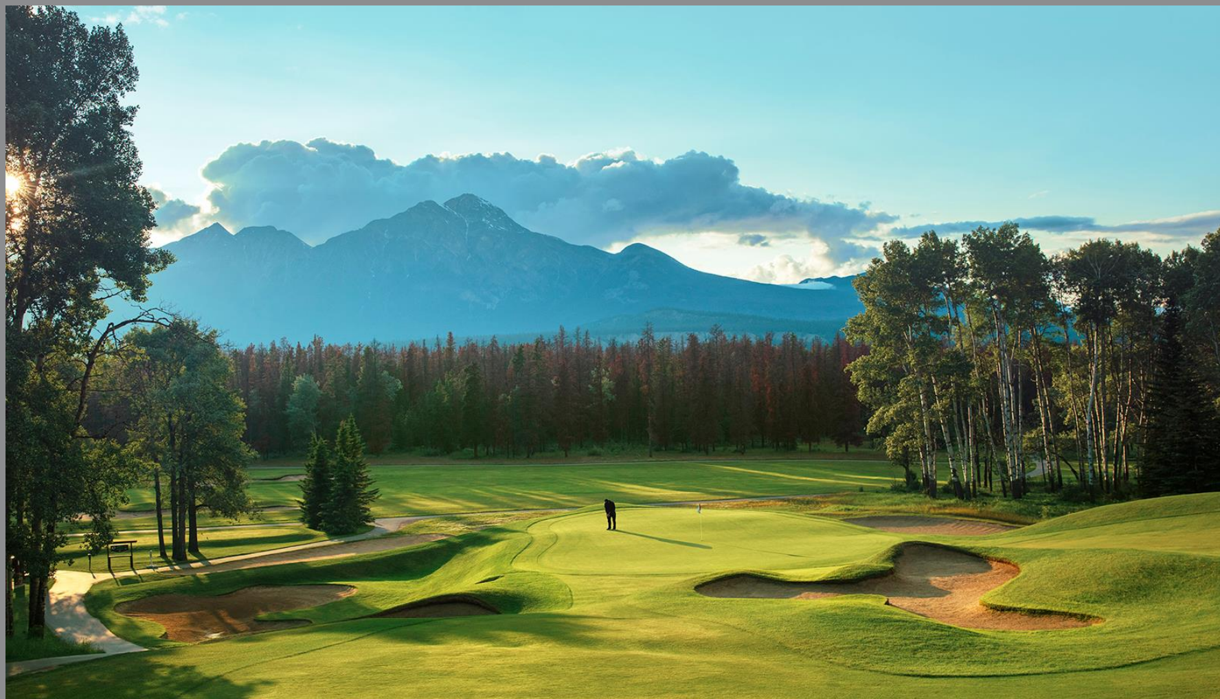
Stanley Thompson 18 Hole Golf Course