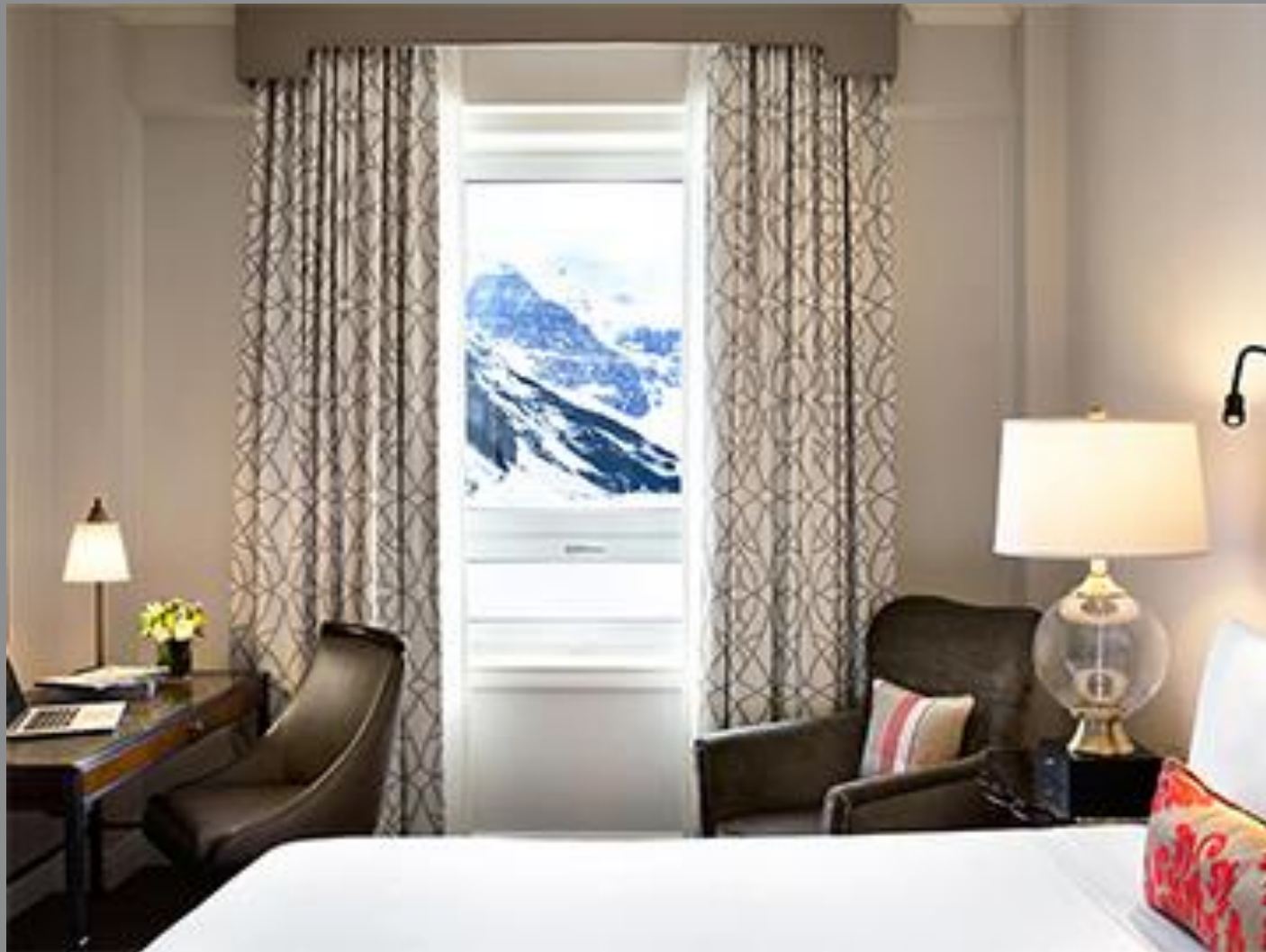
Fairmont Lakeview Room