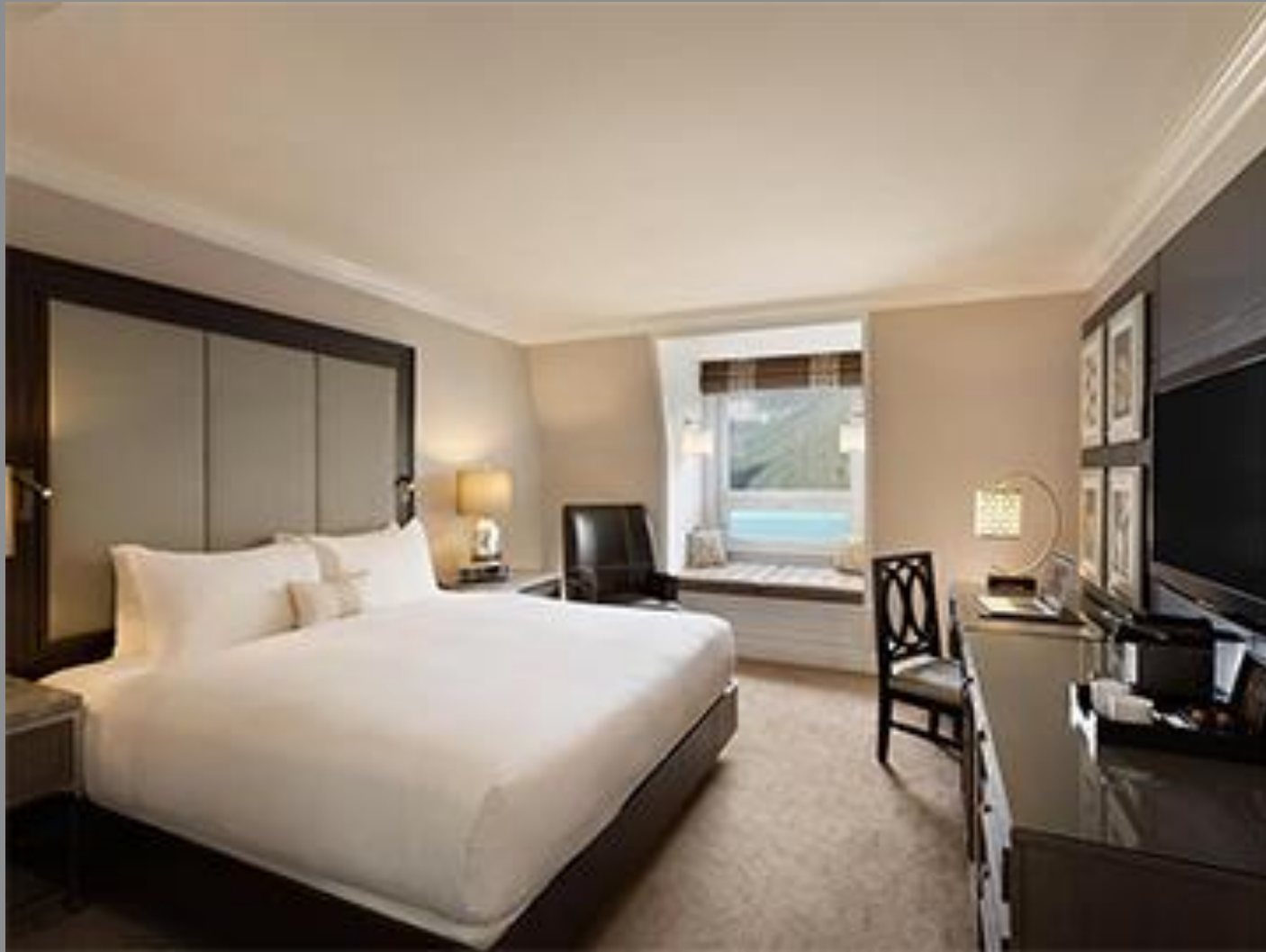
Fairmont Gold Lakeview Room