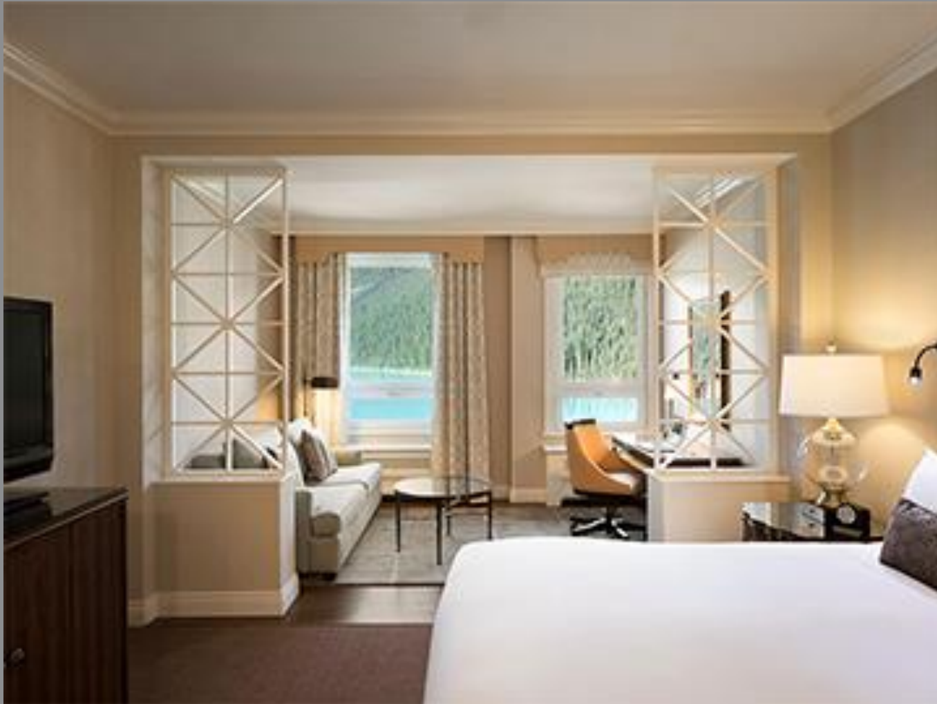
Junior Suite Lakeview