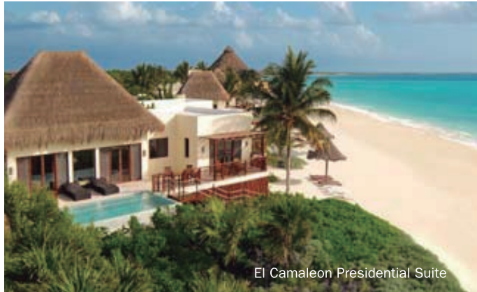
El Camaleon Presidential Suite

All offers are valid for contracts signed between May 1 and December 30, 2020. The late check-out and hospitality room must be requested at time of contracting and are subject to availability. All prices are in USD plus applicable taxes and service charges. No refunds, discounts or concessions will be given for unused services. $9.00 USD plus tax will be added per each guest over the 30 guests included in the Best of My Love package and $12.00 USD plus tax per guest for the Endless Love package. Special decoration, upgrades, enhancements and customizations are available at an additional cost. Bridal bouquet value up to $140.00 USD; groom's boutonniere value up to $20.00 USD. Boutonniere must match the bouquet and must be selected from the vendors list provided by the hotel. Symbolic ceremonies are performed by a Non-Denominational Minister and include a souvenir certificate in English and a sand ceremony. Legal Weddings available at additional cost. Sound system with wireless microphone included for up to 50 guests, upgrade to Medium Audio system (60-120pax) at $260.00 USD plus taxes