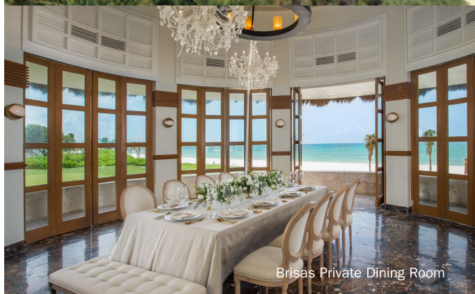
Brisas Private Dining Room