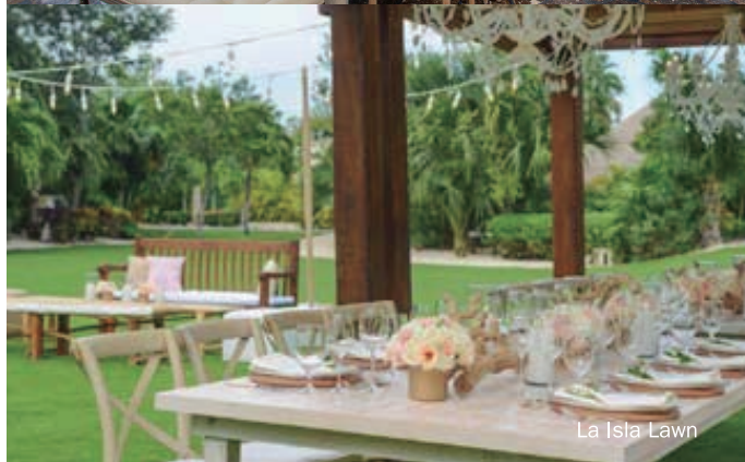
La Isla Lawn