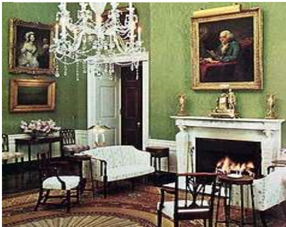
The Green Room of the White House

at the White House, and artfully designed chandeliers are a reminder of modern French design.