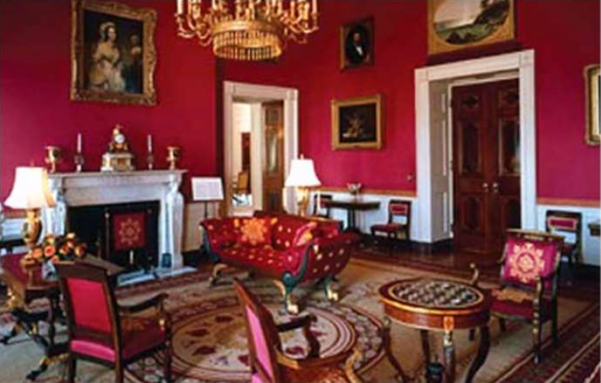
The Red Room of the White House

Named for a suite of furniture covered in "Crimson Plush" that was introduced to the room in 1845, the Red Room was used as a private parlor for some first ladies and as a receiving room during state dinners. It was perhaps the most thoroughly redecorated room during the Kennedy restoration.