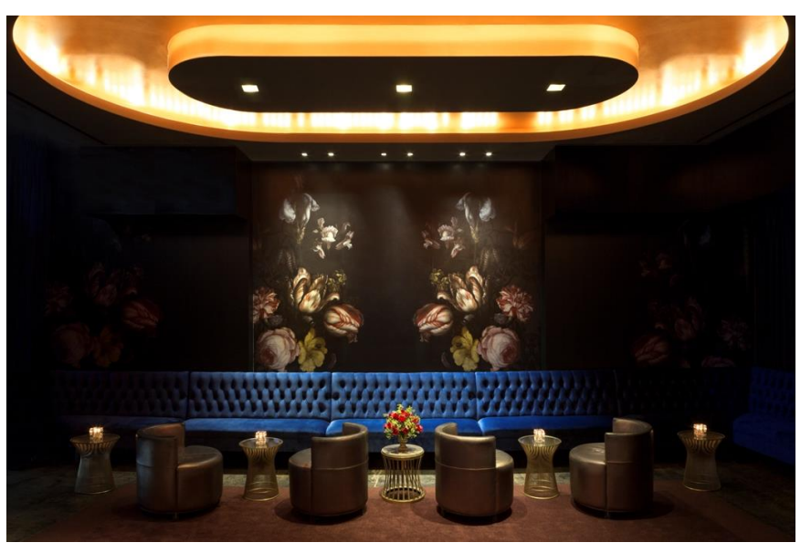
The VIP area