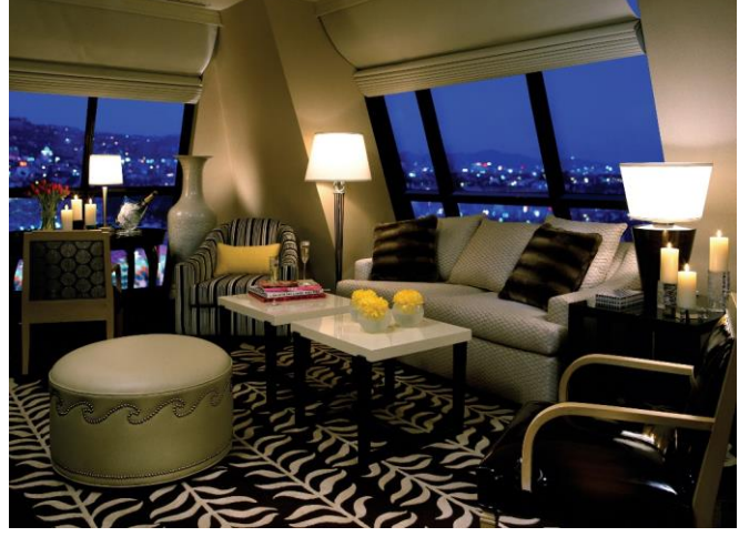
The penthouse living room